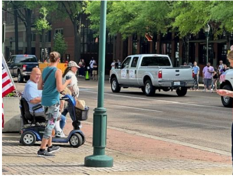
Armed Forces Parade