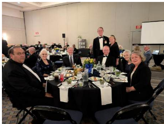
Chattanooga Navy Ball Oct 1, 2025