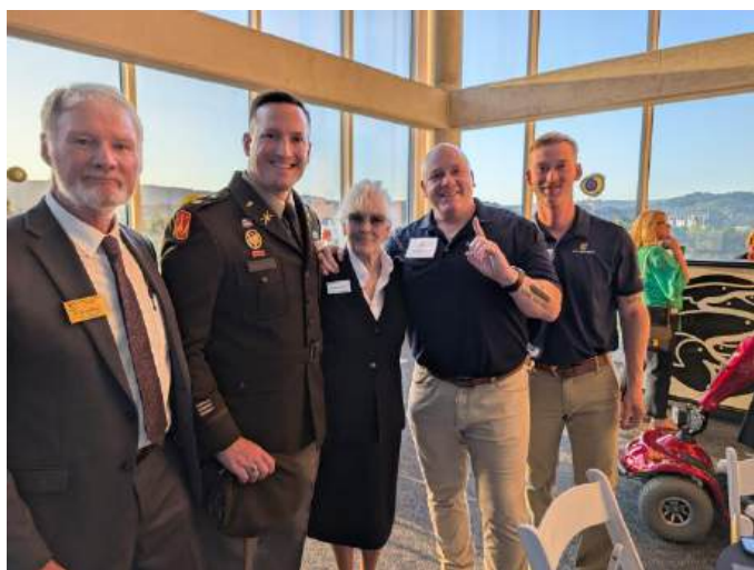
Medal of Honor Reception Oct 02, 2025