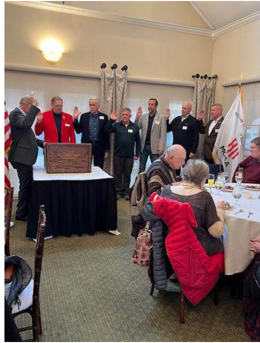
MEC swearing in ceremony Jan 2025