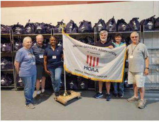
MTC members packed food bags at OSDTN 19 Sept 2025