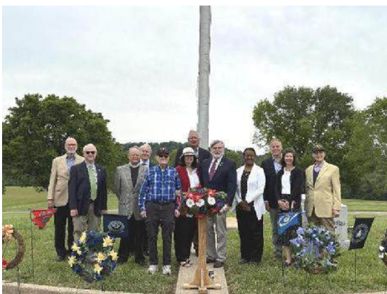
MTC commemoration was held at the Middle TN Veterans Cemetery 24 May 2025