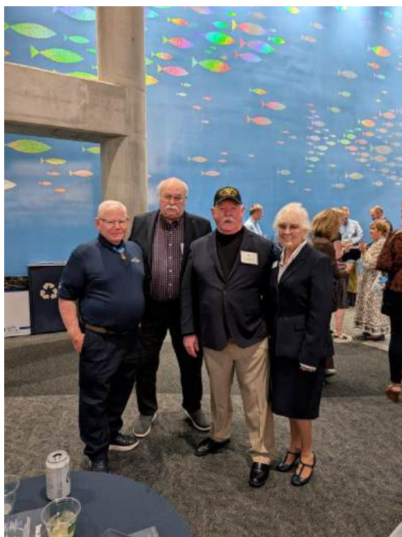
Medal of Honor Reception Oct 02, 2025