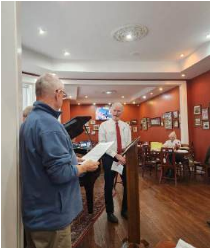
Swearing In January 24, 2024

“Advocacy In Action (AIA)” was nothing new for the council President as he has spent 5 years pounding the hallways of the capitol advocating for Veterans.