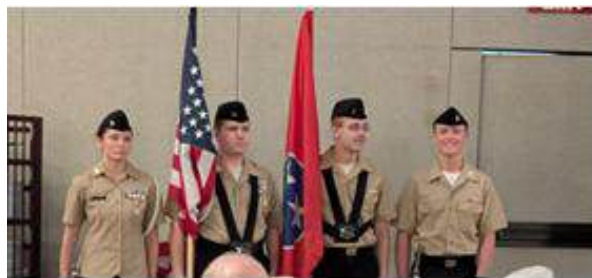
ROTC Honor Guard Chattanooga Navy Ball Oct 1, 2025