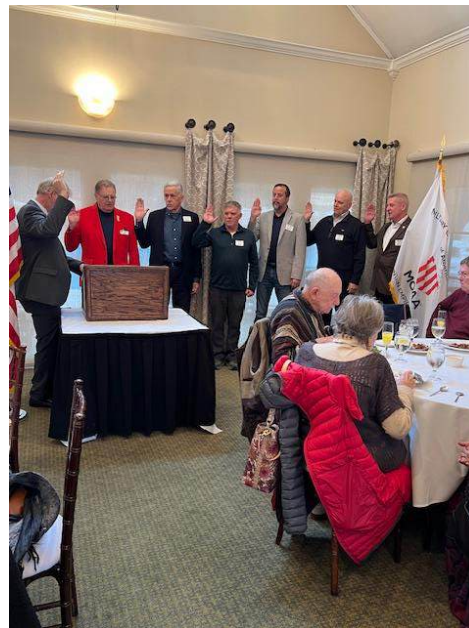
MEC swearing in ceremony Jan 2025