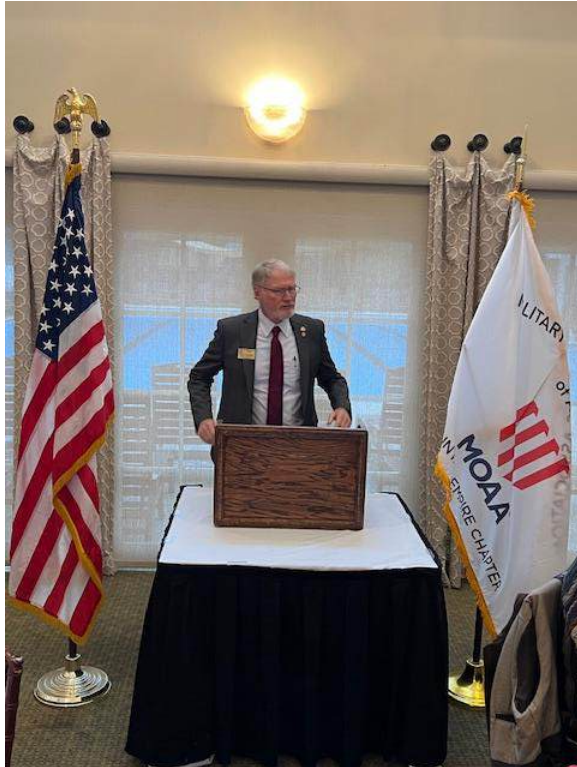
MEC swearing in