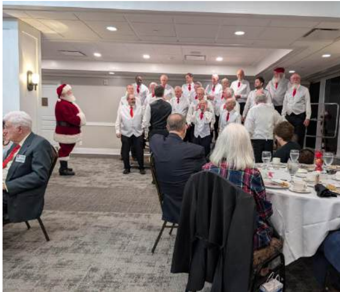
CC Christmas dinner Dec 2024

TN00 CoC TN01 CC TN02 SMC TN03 MC TN04 MTC TN05 MEC TN06 UCC TN07 FCC TN10 SRC TN11 SCC TN12 GAJ