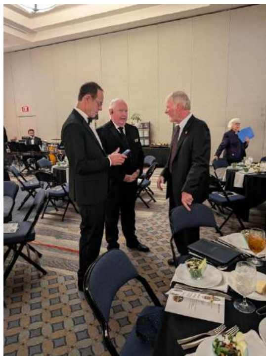
Chattanooga Navy Ball Oct 1, 2025