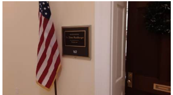
AIA Dr. Diana Harshbarger