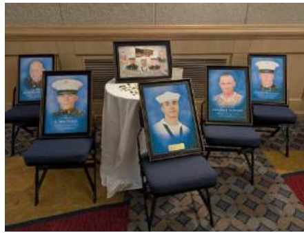
Missing Man Table of Honor Chattanooga Navy Ball Oct 1, 2025

Honoring the Fabulous Five at Chattanooga Navy Ball Oct 1, 2025