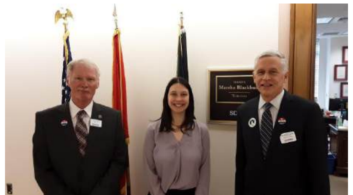
AIA Marsha Blackburn